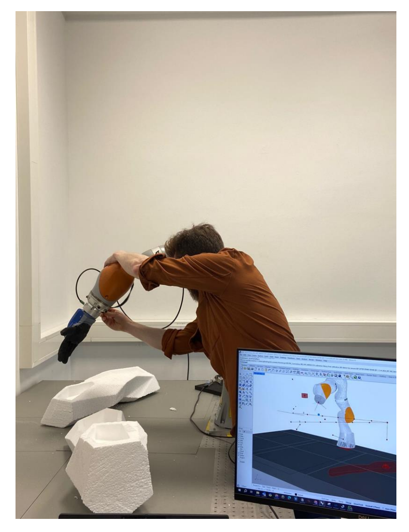
Fig 1. HRI process